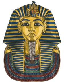
Tutankhamun's death mask

The discovery helped people to understand more about the Egyptians pharaohs .